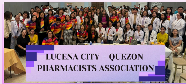
Lucena City-Quezon Pharmacists Association Chapter 2nd Runner-up

The PPhA Ilocos Sur & Abra Chapter, a recently merged chapter, stands as an exemplary team whose collective efforts, collaboration, and innovative spirit have significantly advanced the pharmacy profession across both provinces. Over the years, the chapter has demonstrated excellence through impactful programs that have set high standards in professional service, community engagement, and organizational leadership. Among its notable accomplishments are the successful implementation of collaborative initiatives that address societal and environmental concerns, as well as recognition as one of the Philippine Pharmacists Association Most Outstanding Chapters for 2023 and a recipient of the 10/10 Project for Information Dissemination. The chapter has also made meaningful contributions through community outreach, corporate social responsibility initiatives, and numerous seminars conducted both onsite and virtually.