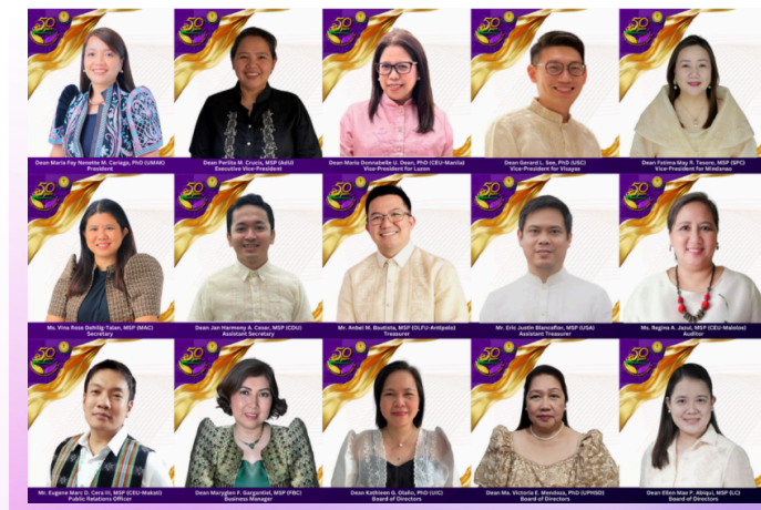
Philippine Association of Colleges of Pharmacy (PACOP) Most Outstanding Associate Organization

underserved and geographically isolated communities in Quezon Province. Over the years, the association has implemented medical awareness campaigns, health screening activities, feeding programs, gift-giving projects, coastal clean-up drives, and community outreach services. A key initiative has been its caravan campaign on antimicrobial stewardship, which addressed public awareness gaps on antimicrobial resistance and promoted the responsible use of medicines across various localities in the province. The association has also conducted workshops and consultations aimed at improving health literacy among the elderly, low-income families, and individuals with limited access to healthcare. The continuity, breadth, and community-based impact of these programs over several decades provide a clear basis for the association's recognition and distinction within the profession.