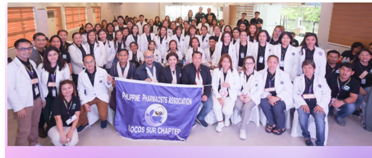
PPhA Ilocos Sur and Abra Chapter Chapter 1st Runner-up

...and PharmaSerbisyo 2024, which provided assistance and healthcare services to communities affected by flooding and landslides in Davao and Davao de Oro. The chapter also collaborated with PRC RXI and BFP Davao to support emergency response efforts and facilitated the establishment of the Davao City Pharmacists Cooperative. In the area of professional development, it implemented the Membership Caravan 2024, established academic partnerships with AMYA Polytechnic College, and conducted training, oath-taking, and employment support activities for pharmacists. These sustained and multi-sectoral initiatives made it the 2025 PPhA Most Outstanding Chapter.