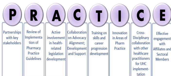
The PPhA Pharmacy Practice Sector—Professional Specialization Committee Key Priority Agenda and Three Year Roadmap (2023-2026)

With strategic representations with key stakeholders including the Department of Health (DoH), the Food and Drug Administration (FDA), the Anti-Red Tape Authority (ARTA), House of Representatives, the upper chamber of the Congress – the Senate, Bureau of Investments (BoI) and Department of Trade and Industry (DTI), along with various professional organizations, PPhA is now poised to play pivotal role in shaping the practice to its full potential.