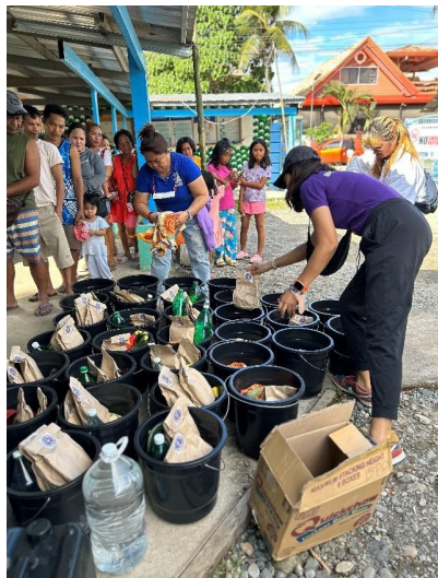
PPhA Davao Del Oro and Davao Del Norte representatives providing aid to the victims of the Masara landslide