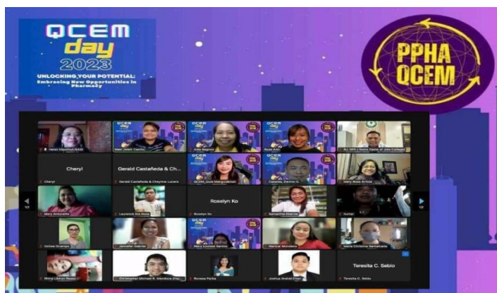
PPhA QCEM Day, August 12, 2023 via zoom