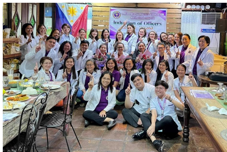
PPhA Nueva Ecija Chapter Induction of Officers October 21, 2023 at Hapag Vicenticos, Cabanatuan City