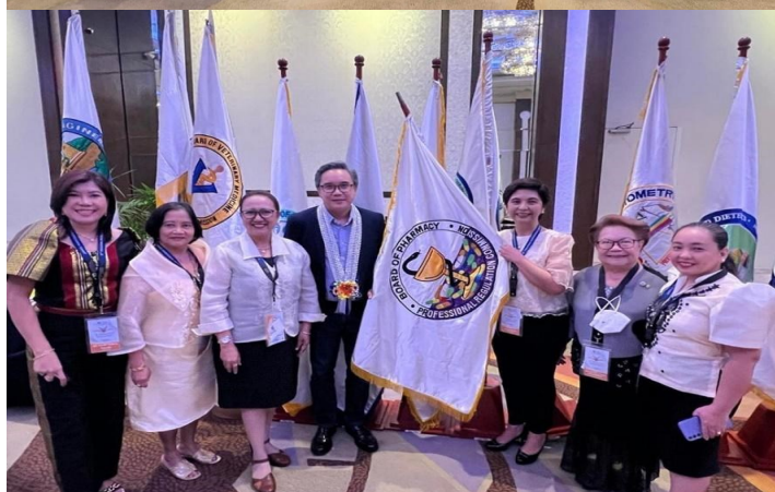
PPhA Officers with the Professional Regulatory Board of Pharmacy at the 12th Philippine Professional Summit