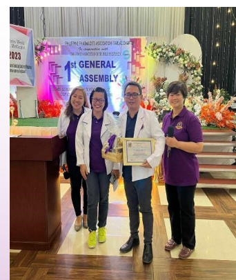
PPhA Tarlac Chapter General Assembly, November 16, 2023 at Tessie's Grills and Roasters Restaurant