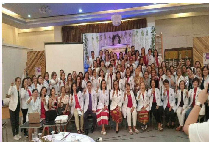
PPhA Batangas Chapter General Membership Meeting, CPD seminar and Election of Officers