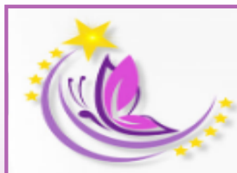
The 2023 PPhA National Convention Logo was conceptualized by Mark Anthony M. Casilla. The design featured a butterfly that signifies the beautiful metamorphosis that comes after overcoming challenges. The ten stars surrounding the butterfly represented the characteristics of the Ten-Star Pharmacist.

The 2023 Convention was very significant in PPhA history as this was also the first PPhA election conducted after the pandemic. ■