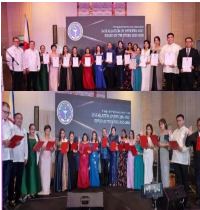
The PPhA Officers for the Term 2023-2026 took their oath last June 25, 2023 at the Bonifacio C Hall Shangri-La The Fort Manila, Taguig City

The installation of the new PPhA Officers and Board of Trustees was held last June 25, 2023 at Bonifacio C Hall Shangri-La The Fort Manila, Taguig City. The PPhA officers were elected from the board of trustees selected by 4,660 out of 5,860 (80%) voters during the elections conducted in the PPhA National Convention 2023 last May 25, 2023 at the SMX Convention Center Clark, Pampanga.