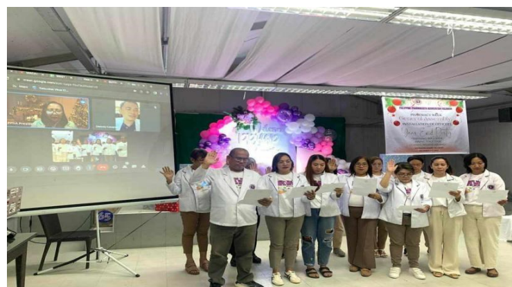
PPhA Palawan Chapter General Membership, Year-end Party and Induction of Officers