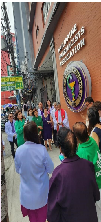
Blessing of the new PPhA Office Facade