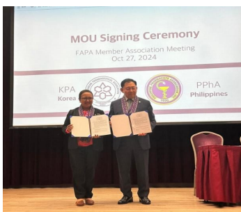
MoU Signing Ceremony between KPA and PPhA