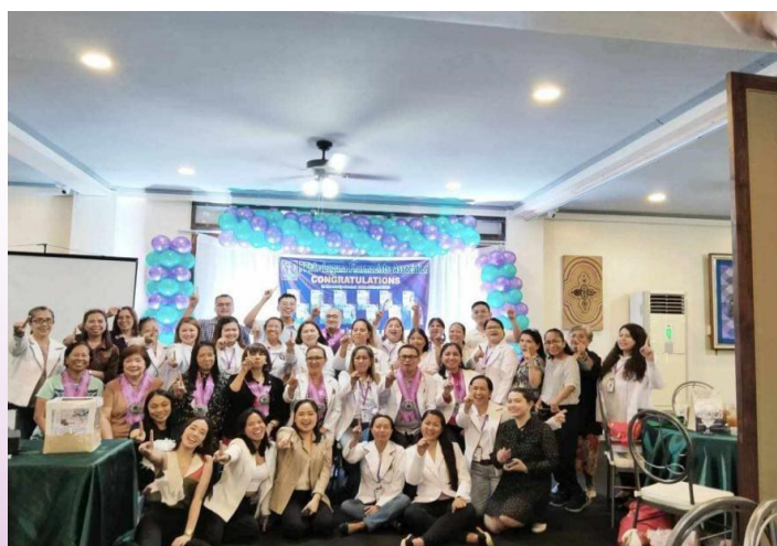
PPhA Laguna Chapter General Membership Meeting and Induction of Officers October 01, 2023 at Danielito's Home Kitchen-Bay, Bay, Laguna