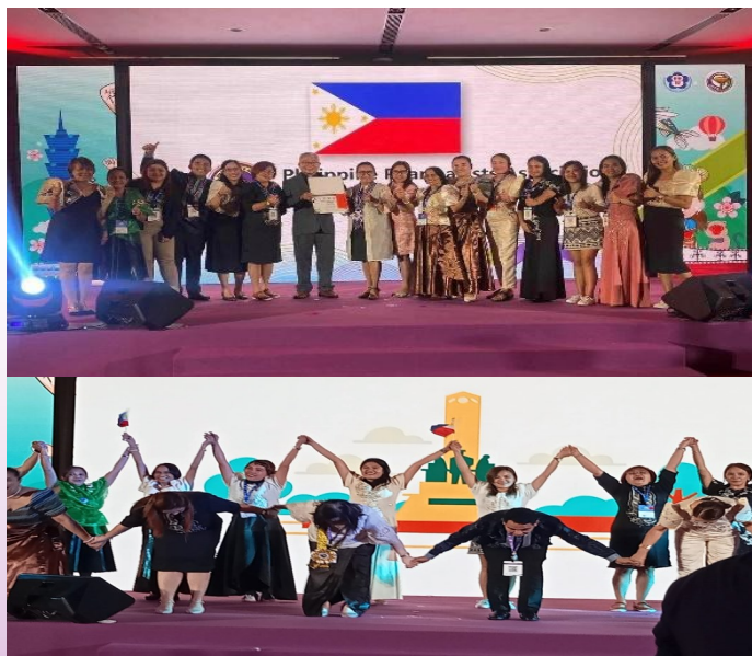
PPhA delegation wins 3rd Best Performance during the Gala Dinner of the FAPA Congress on October 28, 2023 in Taiwan

The PPhA delegation also bagged the 3 rd Best Performer Award as they showcased the true Filipino spirit with their award-winning dance presentation in the Gala Dinner on the last day of the Congress on October 28, 2023. ■